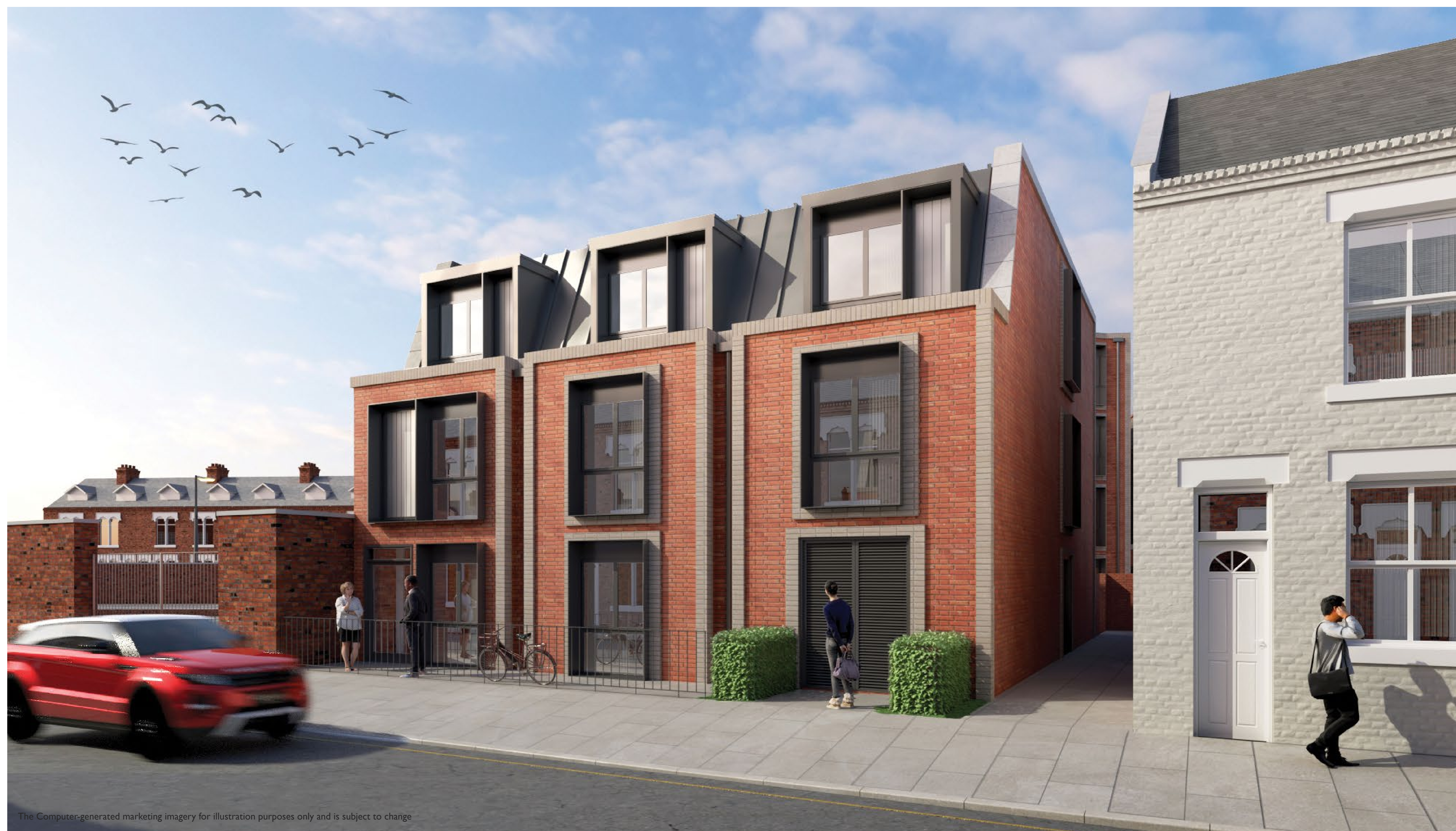
The Computer-generated marketing imagery for illustration purposes only and is subject to change